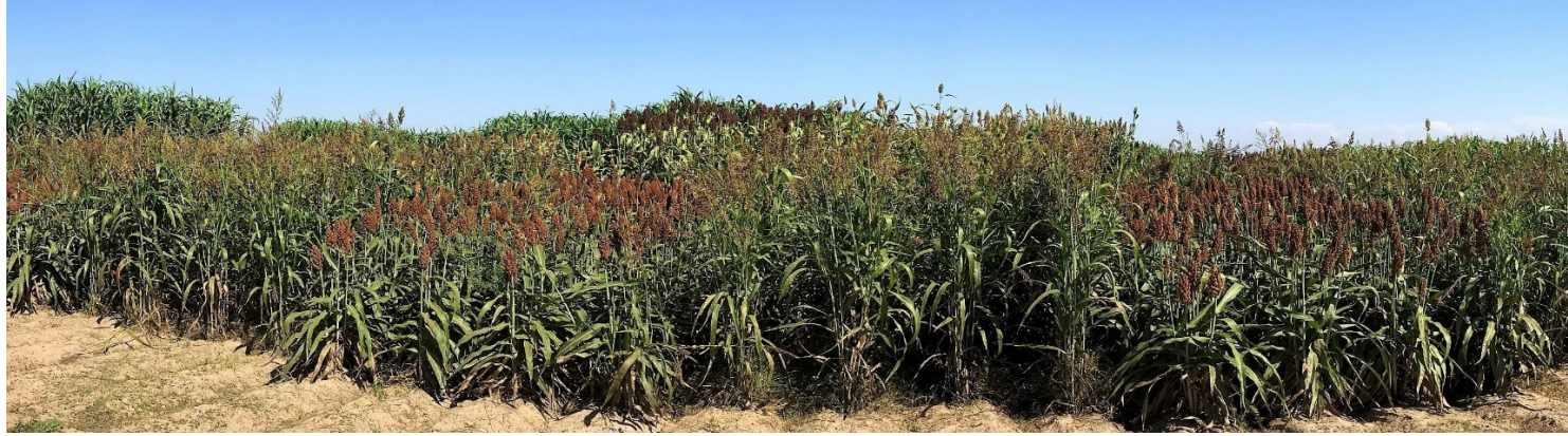
Figure 1. Sorghum Variety Trials Parlier, CA

Sorghum ( Sorghum bicolor [L.] Moench) is the world's fifth most important cereal crop, following rice, maize, wheat, and barley. It plays a key role in animal feed, supporting the dairy and beef industries, pork and poultry production, as well as being used in pet food and bird seed. Additionally, sorghum is a promising candidate for renewable fuels and specialty chemicals. It has also gained popularity in food systems, including gluten-free beer and pastries. With its natural resilience to drought, high temperatures, and poor soil conditions, sorghum is well-suited to adapt to climate change, making it one of the most adaptable forage crops. Ongoing research at the University of California is being conducted at UC Davis, UC Kearney Agricultural Research and Extension Center (KARE), and UC West Side Research and Extension Center (WSREC).